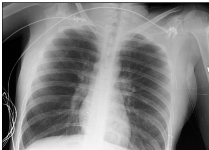
Figure 1. Chest X-Ray